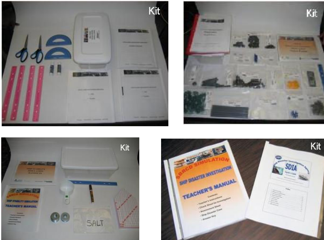
Figure-2, Shipbuilding and Repair Simulation Kits

Students perform each simulation activity in groups of four - five. Students are provided with handouts and manuals which include instructions to carry out simulation activity. The kit comes with a teacher’s manual and model solutions for the simulations. Among the four simulations, shipyard operation and ship construction simulations are more structured while ship stability and ship disaster investigation are open ended simulations where students are given clues and they are encouraged to find solutions.