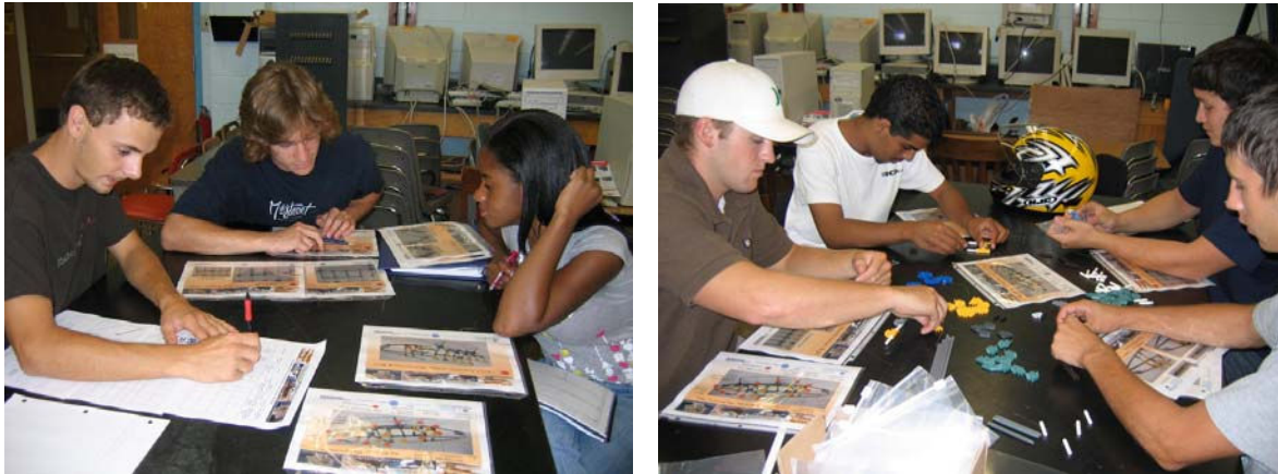
Figure-3, Simulation Activity: Ship Construction Simulation

double the price. If the group ordered too many parts, then they have to pay 20% restocking fee to return the parts.