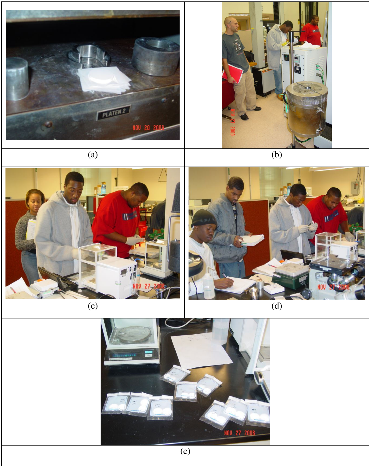
Fig. 2 (a) Green sample ejected from the die, (b) furnace used for sintering, (c) students measuring the weight of the sintered sample, (d) students measuring the dimensions of the sintered sample and (e) sintered samples