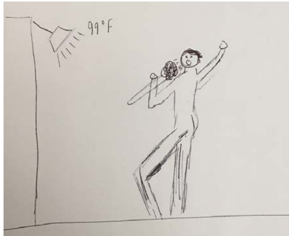
Figure 2: A drawing that a student made to document showering habits

Students were first asked to individually reflect on their own showering practices to highlight the variety of ways people might use hot water and to get them ready to think about the assumptions they might be making about showering and how the water heaters that they had already begun making calculations about might be actually be used. The facilitators guided these students through this 5-minute reflection with prompts and questions to consider such as, “Do you prefer to take showers in the morning or at night? After or around specific activities? How about water temperature? Water pressure? Must you arrange shower schedules around several roommates?”