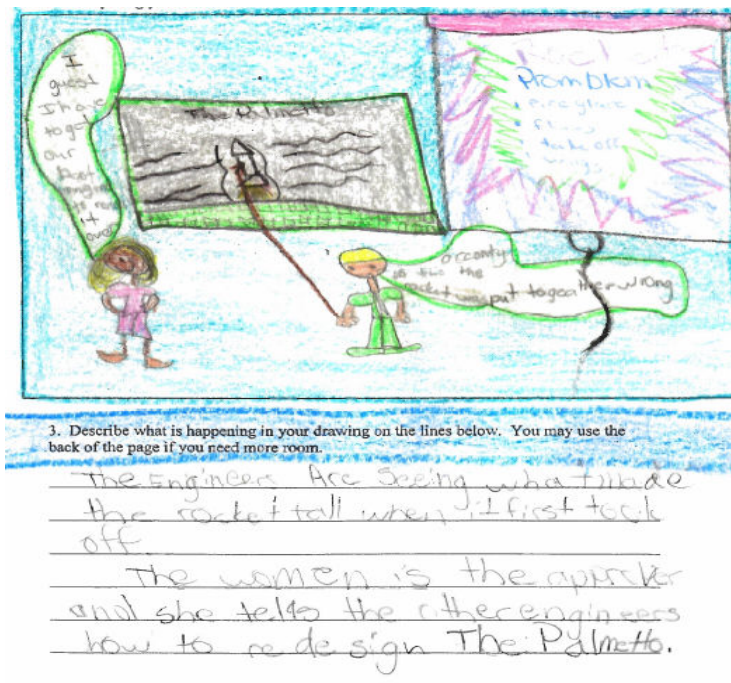
Figure 3. Project Student Work Sample. Caption reads, “The engineers are seeing what made the rocket fall when it first took off. The woman is the approver and she tells the other engineers who to redesign the Palmetto”.

Project student work samples and interview data also emphasized making things better and problem solving as important engineering processes. Figure 3 demonstrates the notions of engineer as problem solver as well as the focus on mental aspects of engineering previously discussed.