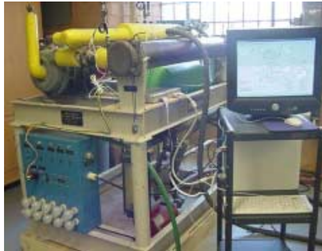
Figure 2. Steam Plant with New Instrumentation in Place

was connected to the DAS board via a shielded cable. The connector block contained a built-in thermocouple temperature compensation cold junction.