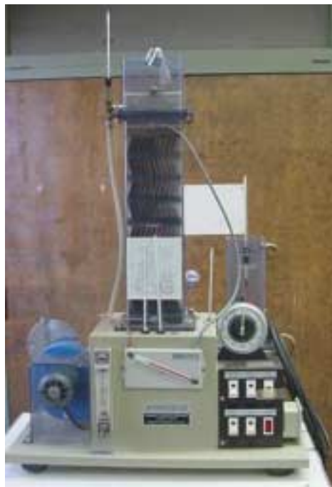
Figure 3. Experimental Cooling Tower

The second experiment selected for modernization was the Water Cooling Tower manufactured by the Armfield Technical Education Company Limited 2 , Ringwood Hampshire England, in 1989. The cooling tower is shown in Figure 3, it is a small-scale water cooling tower that includes all of the components of a full-scale cooling tower including baffles, fan, sump and a water circulating pump.