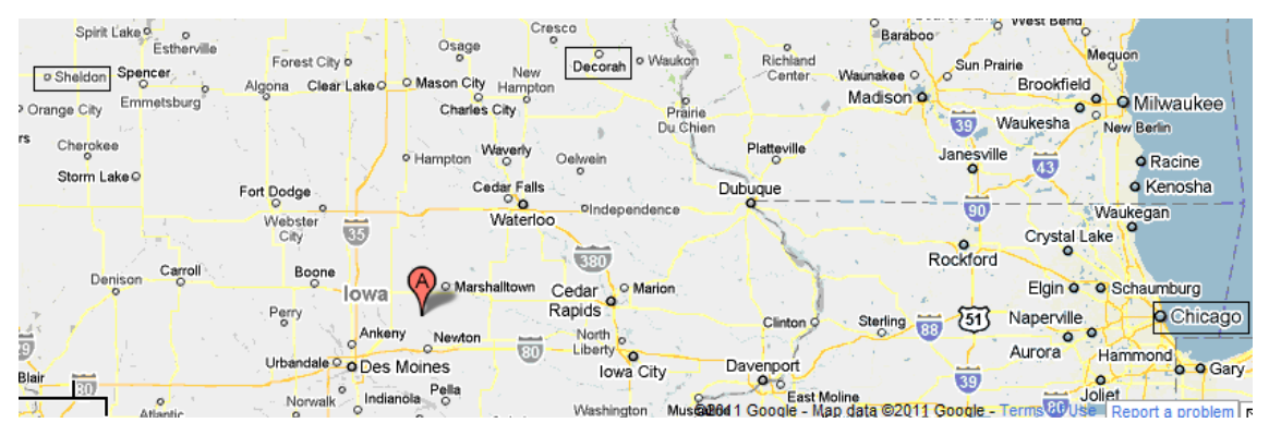
Figure 1. Domestic Plants and Market