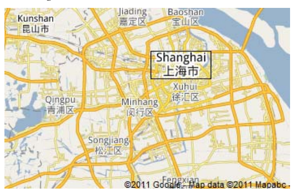
Figure 2. Off-Shore Plant in Shanghai, China

The technical contents of the project were divided into four phases, and a controversial business issue was raised in each phase. Specifically, in Phase I, a human–resources issue of salary and employment was raised. In Phase II and III, accounting and global trade issues of tariff and exchange rate were introduced. Finally, in Phase IV, an environmental issue of pollution fee from carbon emission was brought into discussion. In each phase, student teams were required to analyze 3 or 4 questions, and make strategic as well as tactical decisions: For example,