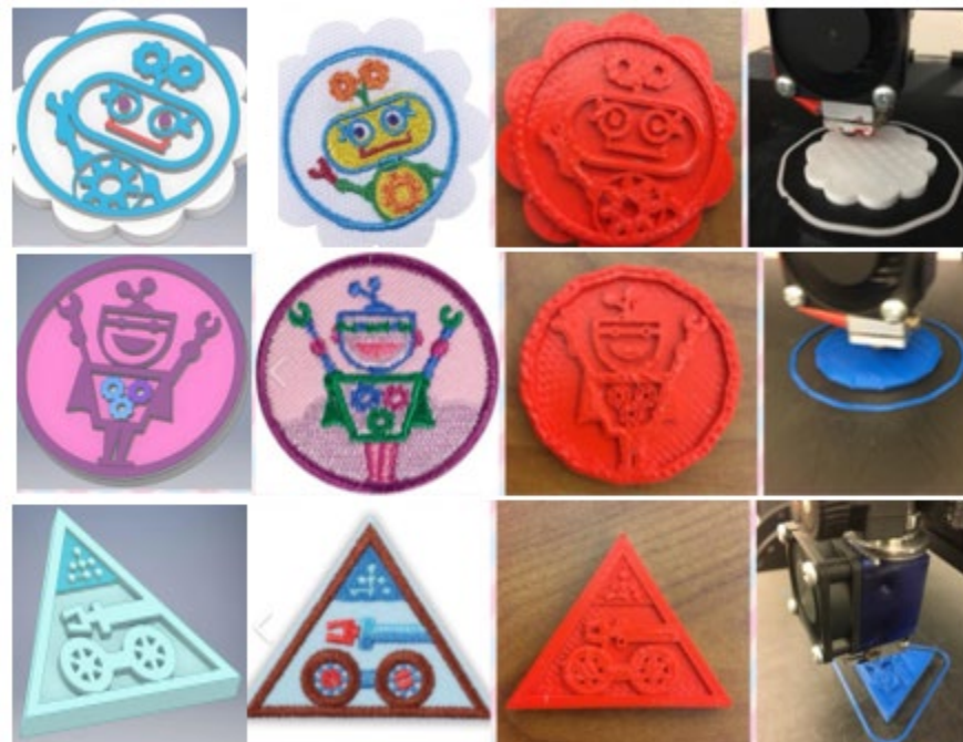
Figure 8: Robotic badges were made on the additive manufacturing system

Station 4: 3D Printers and the Robotics Lab: This station was attended by all groups. The Girl Scout participants were introduced to the 3D printers where they watched how a toy was scanned and printed. During this activity, the Girl Scouts received 3D printed badges, as shown in Figure 8.