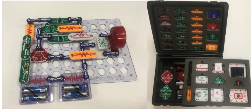
Figure 4: Elenco SC-750 Hobby kits [18]