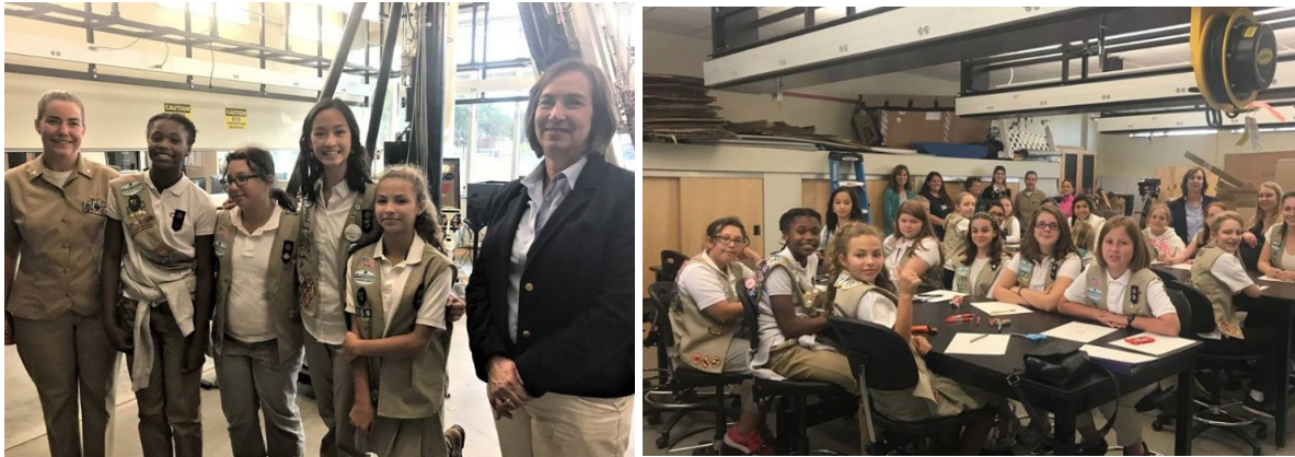
Figure 1: The Assistant Dean for Outreach and Diversity and Girl Scouts participants at the Engineering Badges Workshop at the Batten College of Engineering and Technology, Old Dominion University