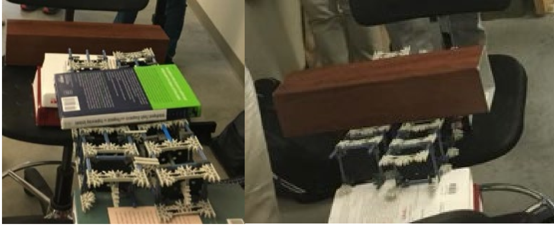
Figure 3: Testing of the bridge structures for how much weight they hold