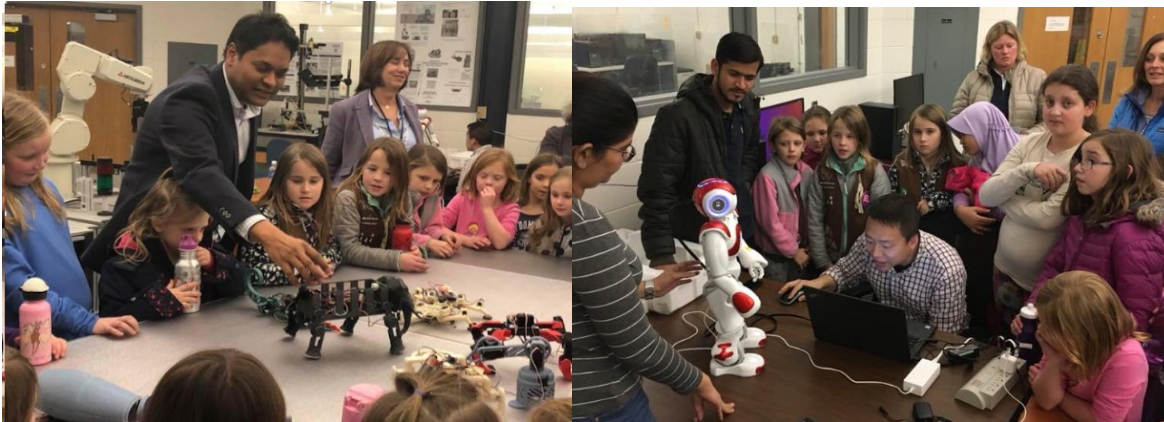
Figure 5: Bio-inspired robotics and humanoid robotics activity

The event started with a video and talk about bio-inspired robotics, which is the core topic of a 400-level senior elective course offered by the Department of Mechanical and Aerospace Engineering. Students in this course learn about the kinematics and mathematical fundamentals of popular robotic configurations, while using biological inspiration to engineer quadrupedal crawling robots over the course of the semester [25]. After the video and the short lecture, the girls were presented with multiple robots designed by the research group from the Collaborative Robotics and Adaptive Machines Laboratory. They also interacted with robots that were designed and built by undergraduate students, as well as with a NAO robot from SoftBank Robotics, as shown in Figure 5 [26].