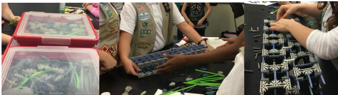
Figure 2: Girl Scouts building different bridge designs during the Engineering Badges workshop

K'Nex [14] is a construction toy system invented by Joel Glickman in 1992 [15, 16]. This toy set has multiple parts that can be assembled together to form various three dimensional structures by combining rods, connectors, and other components [17]. These sets can be sold as kits that include construction steps, bills of materials, and step-by-step instructions that guide students to create a specific construction model, or they can be used for open play and engaging students to create their own designs [17]. K'Nex is designed for 5- to 12-year-old children. The K'Nex Intro to Structures: Bridges kits have been used multiple times during outreach events including with the Girl Scouts and with the Verizon STEM Academy students. These kits allow students to create bridge structures (Figure 2) and then test the bridge structures to see how much weight they will hold (Figure 3).