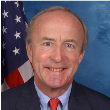
Rodney Frelinghuysen, N.J. Chair