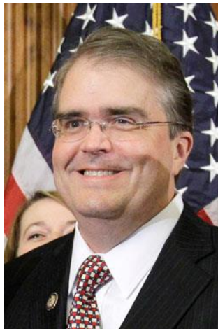
John Culberson, Texas. Commerce, Justice, Science