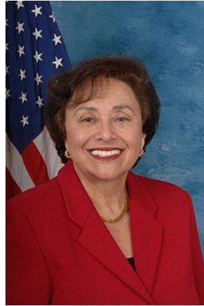
Nita Lowey, N.Y., Ranking Democrat