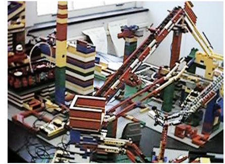
Figure 1: Kinetic Sculptures