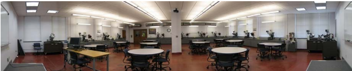
Figure 2. Layout of the integrated freshman classroom / laboratory / shop area.

In addition, parts kits are provided to students which include, as needed, handheld drills, drill bits, and soldering irons, along with miscellaneous parts and accessories.