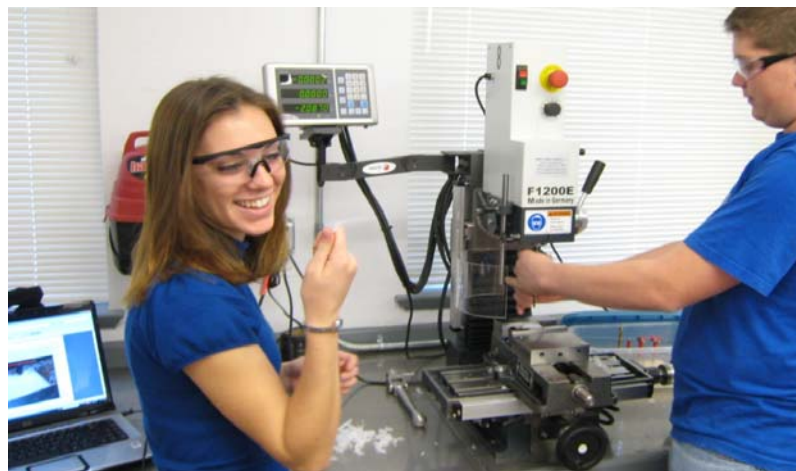
Figure 3. Students using a milling / drilling machine to fabricate a centrifugal pump.

Figure 2 shows the spacing of the milling / drilling machines. A single workstation with one of these machines is shown in Figure 3, along with a student who is working to fabricate the centrifugal pump, which is the project that drives the course content for ENGR 120.