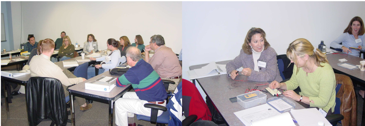
Fig. 2. K-12 Forum participants deliberating high school science curriculum (left); Teachers trying electronic device test kit prepared by RIT faculty (right).