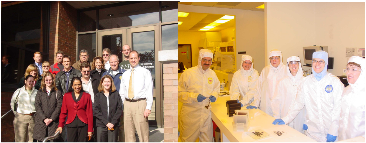
Fig.1. K-12 Forum on Microelectronics and Nanotechnology participants and faculty (left); participants experiencing laboratory in the RIT microelectronics cleanroom (right).