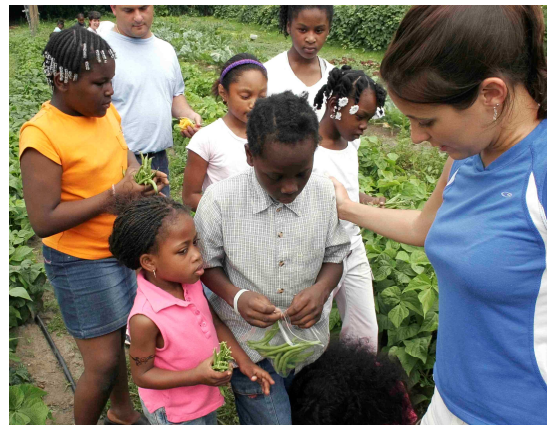
Fig. 4. Service Learning team (faculty and students) at a Northeast Neighborhood Alliance event during the summer 2006