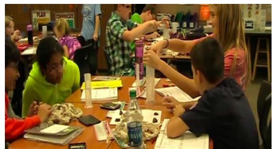
Above Discovering Density lab Left Example of Mineral Sorting Flow Diagram