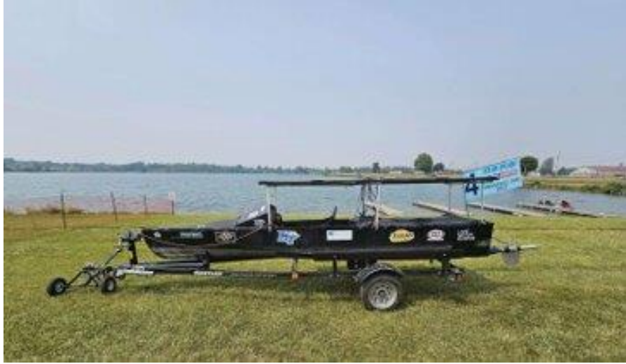
Figure 3: Current boat hull for MTSU's EVP.

When hosting STEM engagement events, the documentation portion of the vehicle competitions are discussed in detail to show the amount of dedication and work it takes to start a successful assembly.