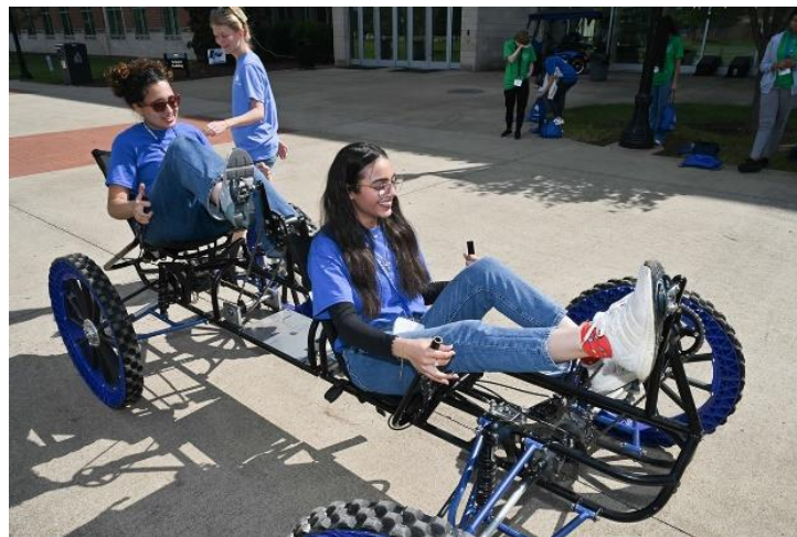
Figure 4: Students participated in the TGIS event and operated a NASA rover.

TGIS is a biannual event that is hosted by MTSU, and participants must register to attend. Registration ensures motivated students will be attending and students participating are excited to learn as it is not a requirement. TGIS is vital to EVP, as the program benefits greatly from diversity and individual ideas. Teaching the importance of STEM engagements while encouraging young women to pursue a degree or career in the STEM field is the highlight of these events. Speaking about the importance of hands-on learning and exposure to the engineering design process creates motivation for students to join a related program. Figure 4 shows excited TGIS students who are operating the 2022 rover design.