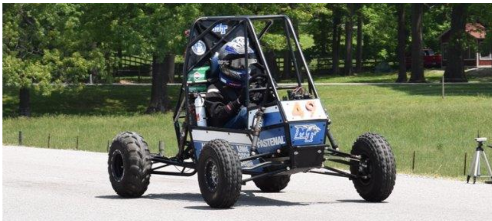
Figure 2: Baja vehicle produced by EVP members.

Another competition students can participate in is the SAE Baja, which includes designing and fabricating a motorized buggy that can traverse through rough terrain without failing. Figure 2 shows the MTSU team in 2022 with their design. Students are also responsible for business and design documentation. The business plan is a required document for competing, and challenges students to create a fictional company with a market plan, business plan, revenue stream, and a cost analysis. Experience in creating an effective business plan will increase students' opportunities in the future and will form confidence in their skills to lead a project in their careers. The Design Review for the Baja competition is a detailed report of every subsystem on the vehicle and the overall assembly and analysis of assembly.