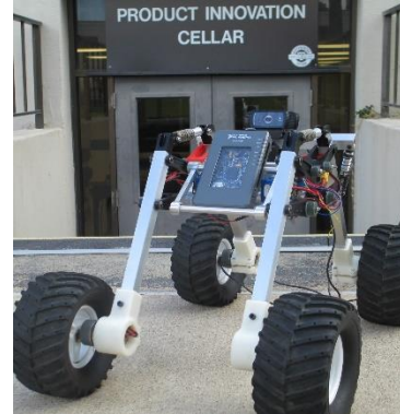
Figure 3. ASEP II Robot.

Platform (ASEP II) robot shown in Figure 3 as the focus for learning about electro-mechanical systems with embedded electronics and control software, the myRIO has been selected and procured. Each student will be issued a myRIO and teams of two students will share an NI mechatronics kit. These resources will be used throughout the course and its associated laboratories. One of the reason this embedded system was selected was its ease of use, ability to be programmed using the LabVIEW graphical programming environment and its ability to communicate wirelessly to a laptop or computer acting as a base station. In addition, the myRIO can support the integration of video/image information and process these data for situational awareness and control.