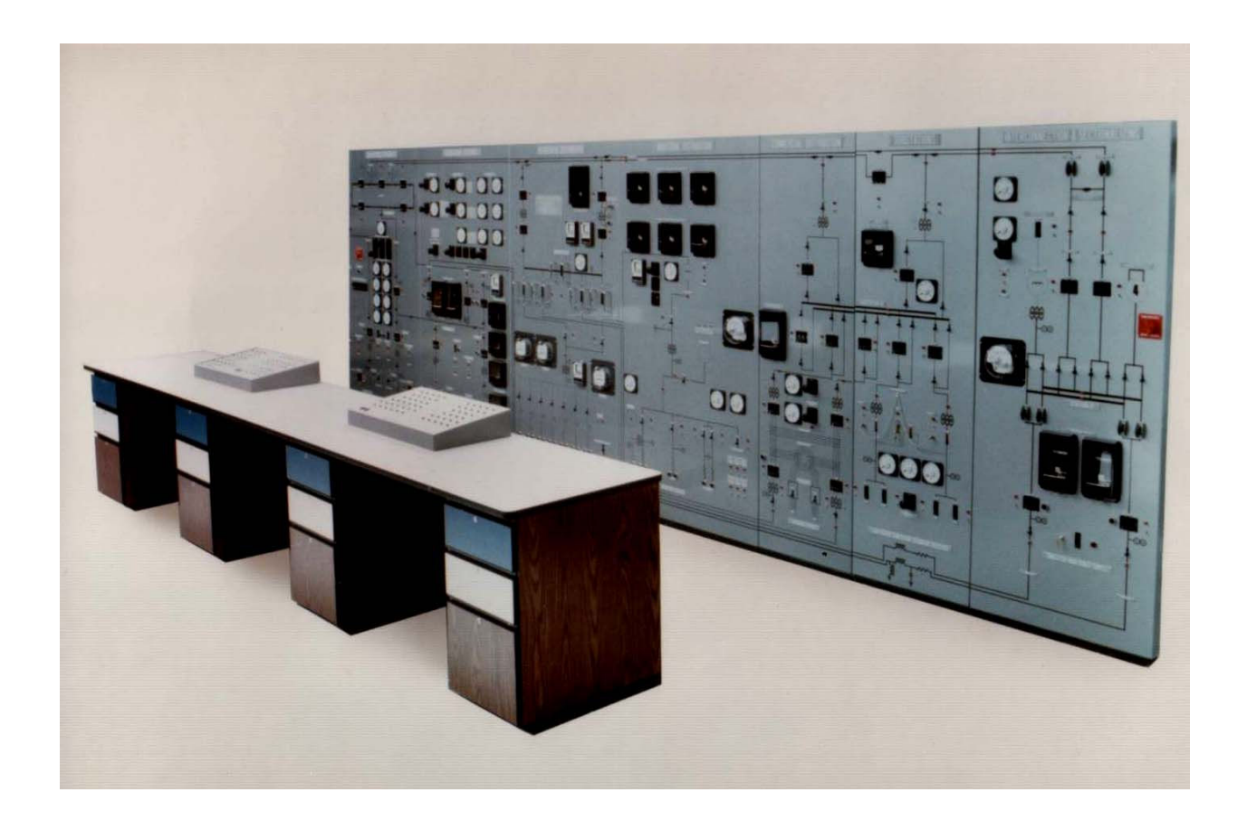
FIGURE 2 Hampden Model 180 Power System Simulator

An example of the one-line diagram graphics display on the remote SCADA system for the Power System Simulator is depicted in Figure 3.