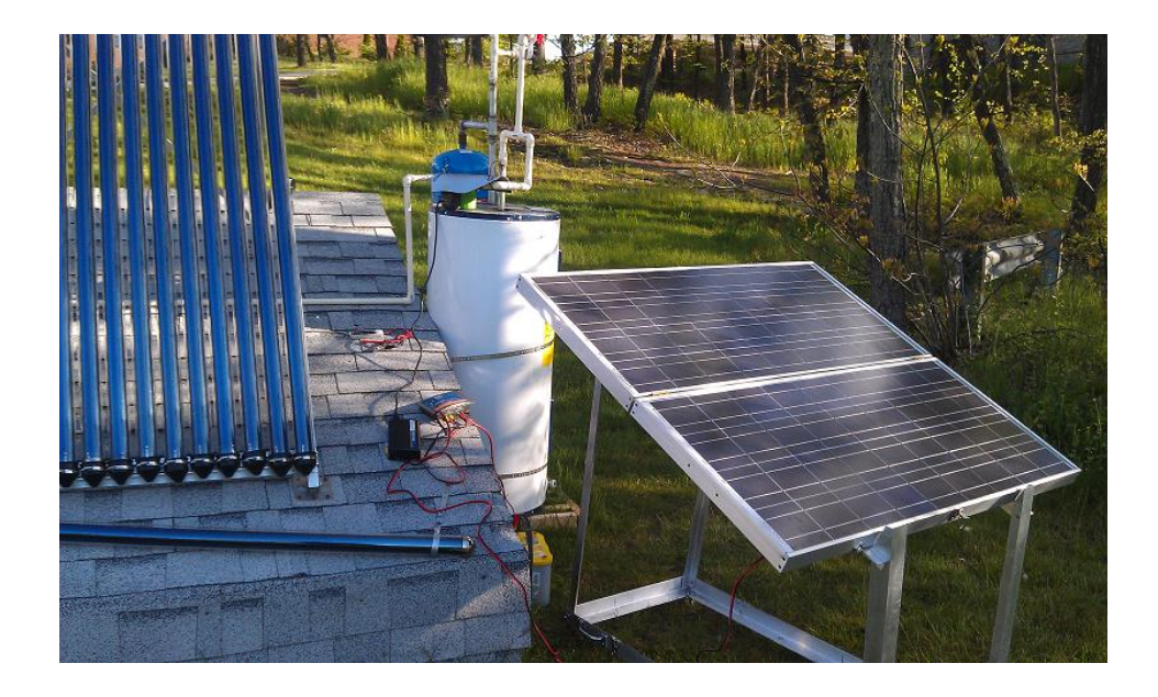
Figure 3 – Solar Cart Providing Power to a Pump for a Solar Water Heating System