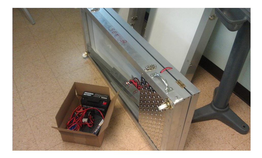
Figure 2 – PV Mobile Carts in Attaché Storage Configuration

In addition to the carts themselves, the mobile PV laboratory has the following electrical components: