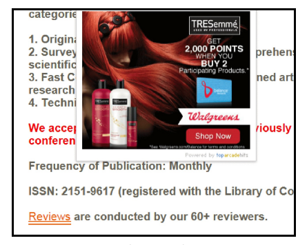
Figure 6. Ad supplants review link<sup>28</sup>

Other sites indicate that papers are reviewed but include no link to a process. The Research Inventy [sic] site, for example, indicates a 5-7 working day timeline for reviews, <sup>29</sup> but a thorough investigation of this site reveals no extant policy. Randomly checking STEM-related journals on Beall's 2012 list suggests that this is common practice. Still other "review processes" seem to rely solely on the use of plagiarism