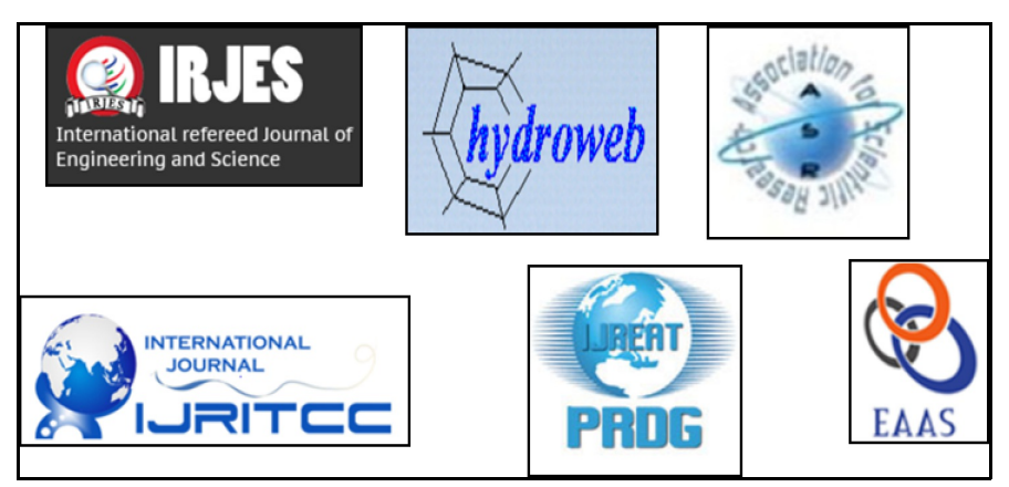
Figure 4. Uninspired website logos<sup>23, 24, 25, 22, 26, 27</sup>

Some sites have a decidedly amateurish look, with simplistic logos, such as the ones shown in Figure 4. It is improbable that any of these is the product of a graphic designer; in fact, after checking about 25 of these types of journals, I discovered that pictures of the world seem to be the most popular image, especially for journals whose titles begin with the words "international," "universal," or "world."