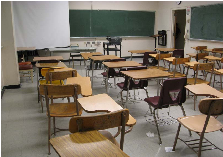
Figure 2: Typical smart room used for element design courses