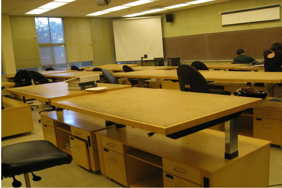
Figure 3: Typical smart room used for laboratory design courses