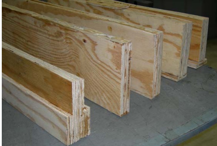
Figure 2: Fall 2006 beams, creativity was not a requirement