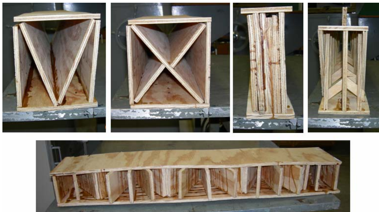
Figure 4: 2006 Engineering Summer Camp Beams, no shape restrictions, no creativity requirement