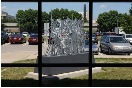
Figure 1. Charles McGee Sculpture

The second issue involved the decoration of the main hallway that runs the length of the building. After much discussion with ideas that ranged from photographs of old cars to simply letting the walls stand bare, it was decided that continuing the focus that began with the McGee sculpture at the entrance was logical. Original art work that reflected the research going on in the building would be an appropriate way to enhance the building's walls and foster the connections between art and engineering. More discussion ensued and after it was decided that instead of simply going out and buying professionally created art work, the conclusion was to approach local high schools and ask for their student's artistic contributions. This approach would serve three distinct purposes: produce art for the walls, give high school students a chance to express themselves within an engineering context, and open up possible avenues for students who had never thought of engineering as a career path. The last issue addressed the current high school students who would like to be able to delve into engineering without leaving their fine arts interests behind.