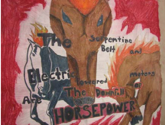
Figure 4. Brett Thorpe - Williamston High School