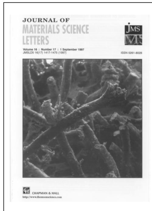
Figure 3. Example of student capstone project (scanning electron microphotograph) on the cover of the issuing journal 2 .