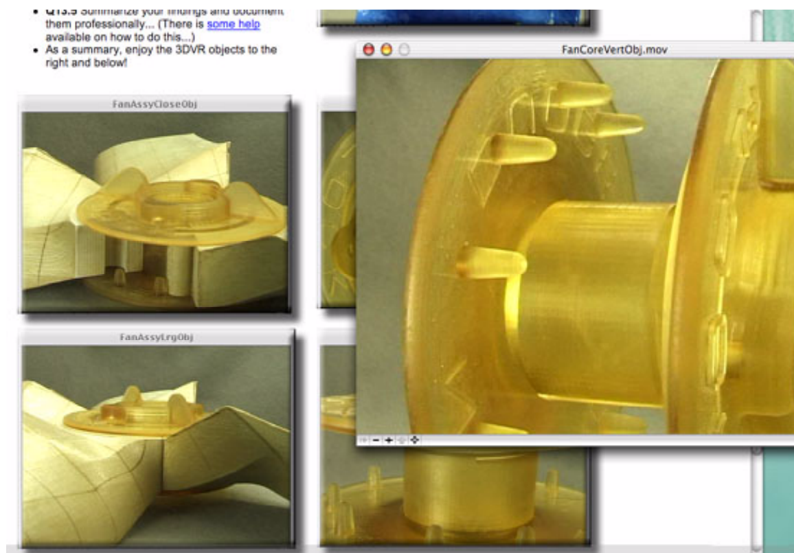
Figure 2 illustrates several interactive 3D virtual reality objects, rapid prototyped propellers, that enable students to explore an-in-depth view of the discussed subject area.

This approach keeps the students interested in the subject they learn, because they can actively interact with the computer, showing them exciting 3D interactive animations, and active code they can run with their own data, encouraging independence from their tutor. (Please note, that our original screens are in high quality, full screen and full color graphics, that we had to reduce in size and quality to fit the format requirements of this paper. Please visit http://www.cimwareukandusa.com , and then click on the Case Library icon to view these screen-prints in full color and high quality.)