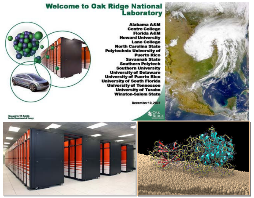
Figure 1. RAMS Faculty / Mentor Workshop held at ORNL in December 2007 [3,4,5]. Research topics in climate modeling, computational science, and computational biology were discussed.

To assist in identifying students and developing the research proposal, a faculty mentor workshop is offered for university faculty advisors each year prior to students RAMS application. As indicated in Figure 1, more than 13 HBCUs and Minority Institutions participated in the 2007 workshop. In the workshop, RAMS summer research internship applications and selection criteria are discussed. The DOE program managers offer updates on HBCU programs, ORNL mentors and scientists present their on-going research projects and their expectations from student interns. These workshops provide an excellent opportunity for faculty to learn on-going research activities at ORNL and a platform for faculty collaboration with ORNL scientists. Faculty advisors are also able to provide advice to students on research proposals.