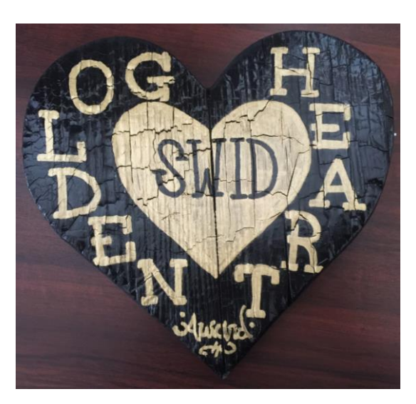
Figure 3: Golden Heart Award

The above response from the students shows how they are going beyond their comfort zone to learn the practical applications of the skills that they learn in school. In additional to the wealth of experience that they are accumulating, the students also receive a "golden heart award" from staying committed to the project and completing it. The award included a plaque designed by an artist for SWID and a $1000 scholarship.