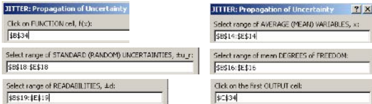
Figure 9 JITTER macro input boxes with worksheet ranges for wood density exercise.

required information. The input boxes displayed in Figure 9 show the cell and range addresses used for the wood density exercise.