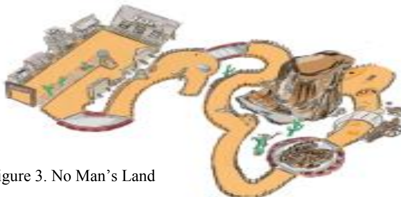
Figure 3. No Man's Land