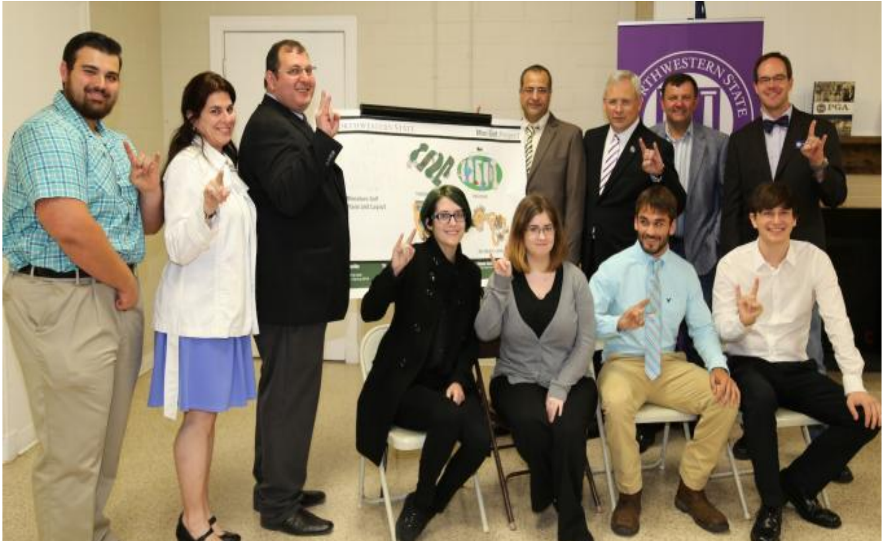
Figure 8. Press release picture between the ET and CPA Departments, NSU in presence of the Mayor of Leesville city, The president of NSU, the head of Both departments, The students along with the two professors that worked on the Project