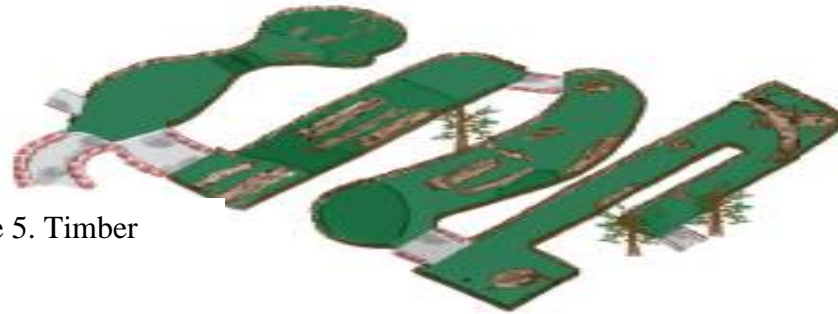
Figure 5. Timber