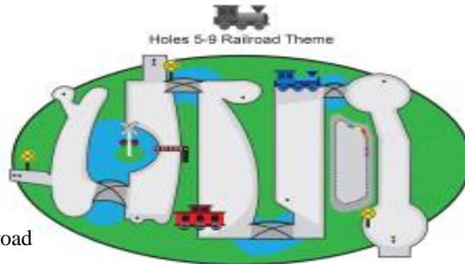
Figure 4. Railroad