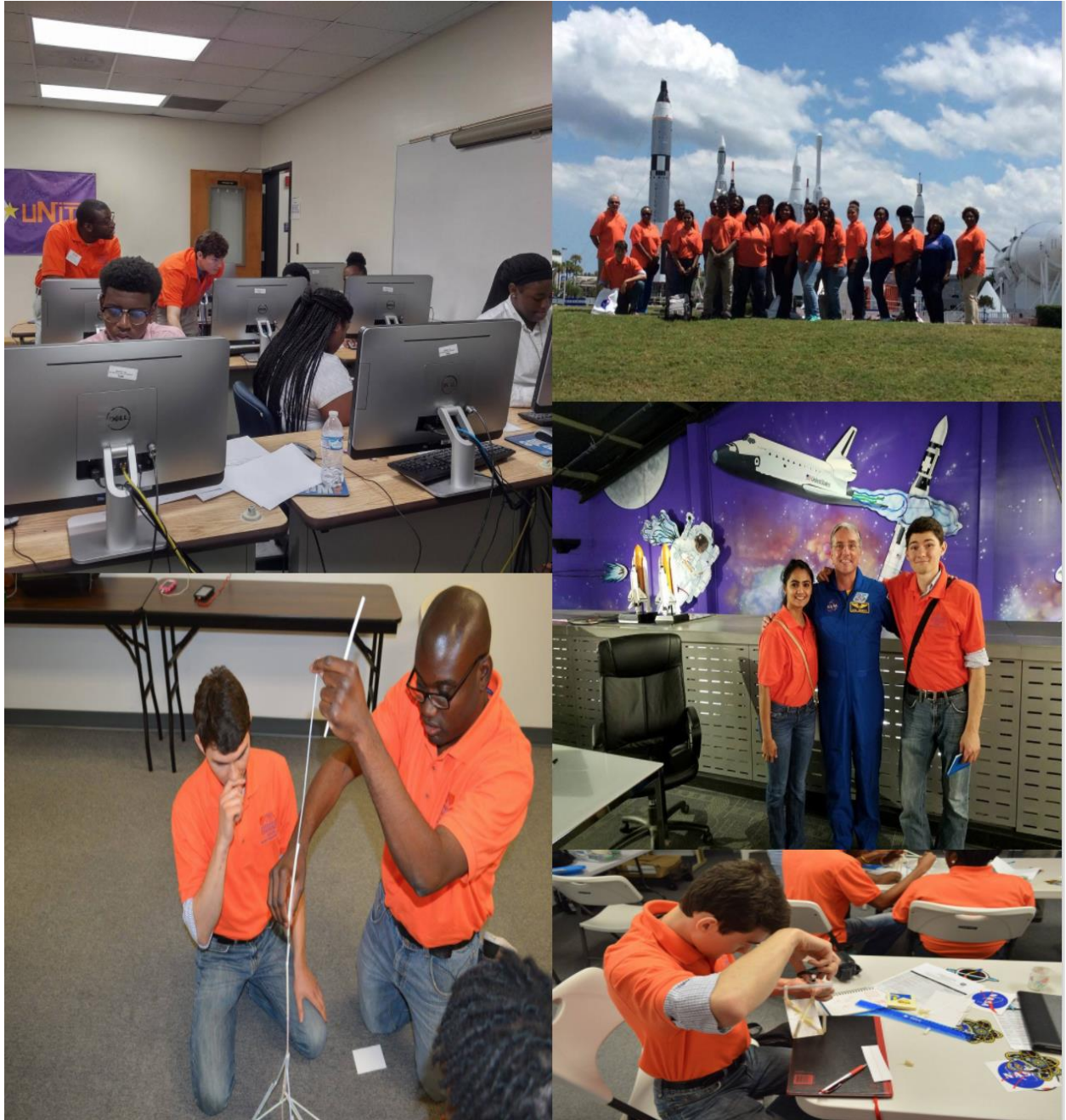
Figure 3: Images taken of interns during the course of the NOYCE summer program