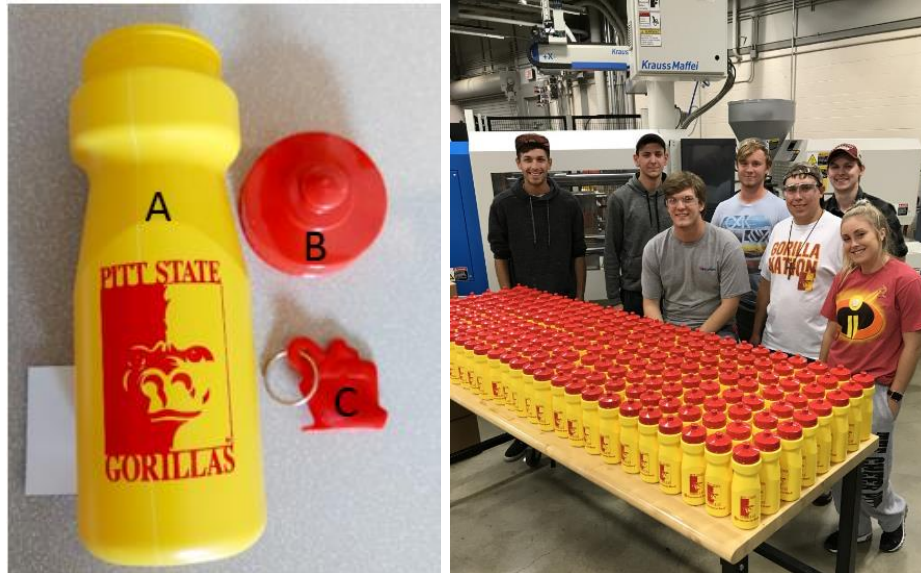
Figure 3: Left: A) Blow-molded bottle with screen printed decoration, B) Injection molded bottle lid, and C) Gorilla keychain made from discarded cup holders. Right: Students at a PET Production Party.