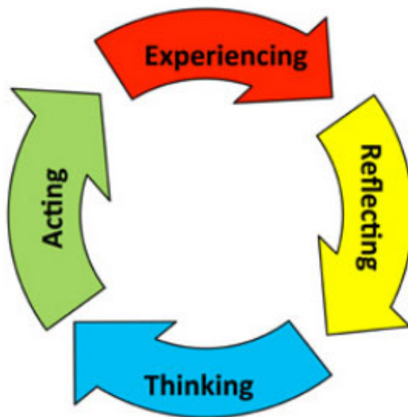
Figure 1: Kolb’s Experiential Learning Model

constructs a mental model based on interaction with environment [6]; Lev Vygotsky’s learning theories which stress the critical role of social interaction in learning [7]; and John Dewey’s pragmatism which delineates the learner’s role in identifying constructs based on successful human interaction and active manipulation of the environment to test hypotheses before moving on [8]. David Kolb draws upon these educational theorists and theories and posits a four-stage cycle of the learning process which is a “holistic integrative perspective that combines experience, perception, cognition and behavior” as represented in Figure 1. Kolb posits that people “learn best through experience.” The basic theoretical model for experiential learning includes four stages: concrete experience, abstract conceptualization, reflective observation, and active experimentation [2]. Experiential learning emphasizes the process of learning rather than the outcomes.