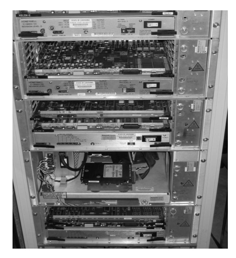
Figure 5 Honeywell TDC 3000 system LCN cabinets

experienced almost every aspect in a fluid temperature control. If we have more time, we can change the process to flow rate or level.