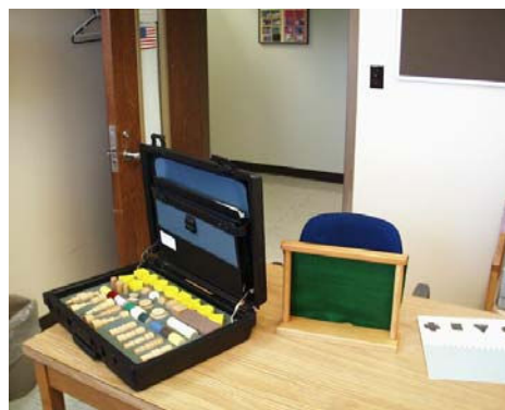
Figure 1. HVDT setup from examiner's perspective

The case containing the test objects must be placed in a position where the subject cannot view the objects. The subject places their right hand through the opening in the visual screen and the examiner places an object in their hand. The subject is allowed to manipulate the object in their right hand without seeing it, and then is asked to point to the corresponding object on the identification chart with their left hand 8 . A picture showing the typical setup of the testing environment from the test examiner's perspective is shown in Figure 1. There is no set time limit to administer the HVDT and the average time required by subjects in this study was 10 to 15 minutes. Scores were recorded on a standard score sheet by the examiner.