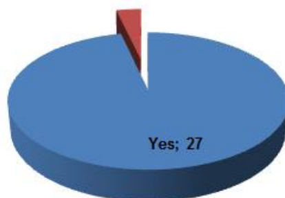
Figure 2. Students overwhelmingly reported that they expect the 2013 Collaborative Field Course will have an impact on their future academic and professional plans.

Do you anticipate that this course will have an impact on your academic, personal, and/or professional plans in the future?