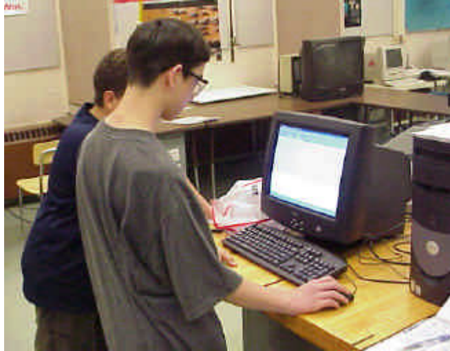
Figure 3: Students at Scarlett Middle School are working on SpectraCAM software