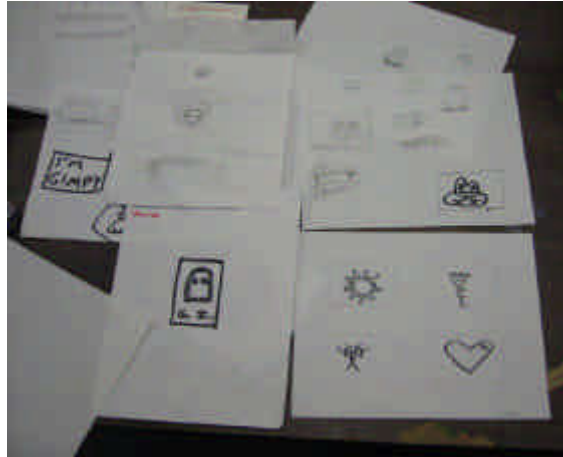
Figure 2: Some design ideas students created

A template called “aaps.dwt” has been prepared for the students to facilitate the drawing process and also in visualizing the actual machining process. The template consists of a 2"x3" rectangle, which represents the surface area of the acrylic block that will be machined. The other important feature of this template is the pre-set line thickness. Since the cutting tool used in the machining operation is \frac{1}{8} inch in dia., the thickness of the lines in the template are arranged such that the drawing created with this template will give the students an idea of the actual machining process. This second feature is also provided to avoid unexpected overlapping during machining.