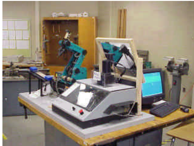
Figure 1: The CNC milling machine and the robot used in Portable Manufacturing System Project

The PMSP cell is composed of a CNC milling machine, a robot, and a personal computer (PC) that controls the entire system. To facilitate the simultaneous access of multiple student users, six additional PC's are also used. The PMSP uses four different software packages, which are AutoCAD, SpectraCAM Milling, WSLM and SCORBASE for the ER 4u robot, throughout the program.