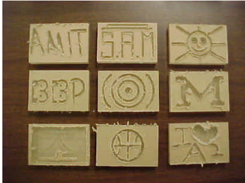
Figure 5: Some of the student designs that are machined

2002-2003, the Portable Manufacturing System Project has been implemented as part of the Technical Education class in seven schools in the Ann Arbor District, six of which are middle schools. Over 950 students are exposed to the program and 820 of those are middle school students. In the Ann Arbor School District, the PMSP is planning to serve over 500 students annually.