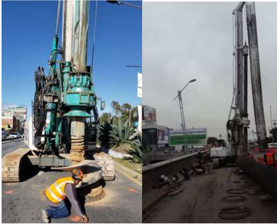
Figure 3. Drilling and bar reinforcement location in pile foundations.