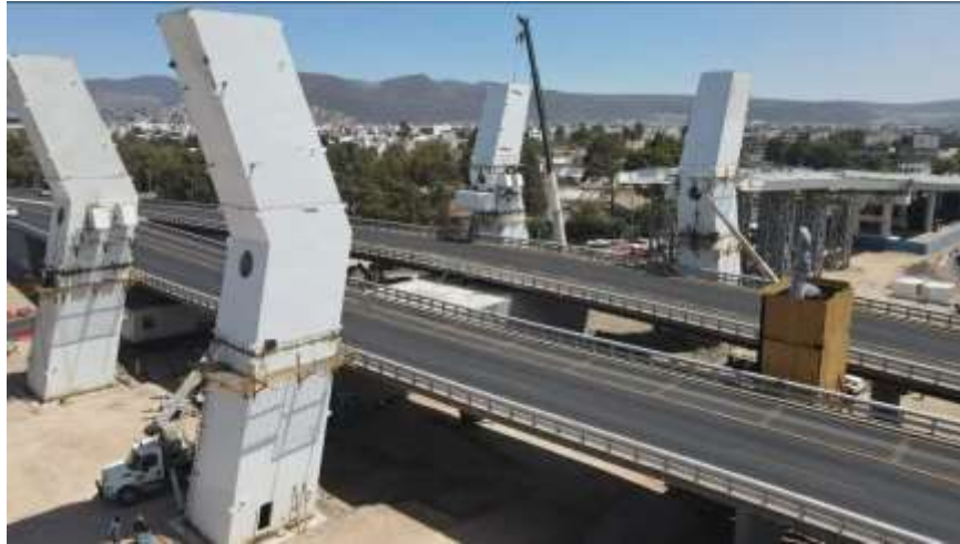
Figure 5. Cable-stayed bridge set of pylons.