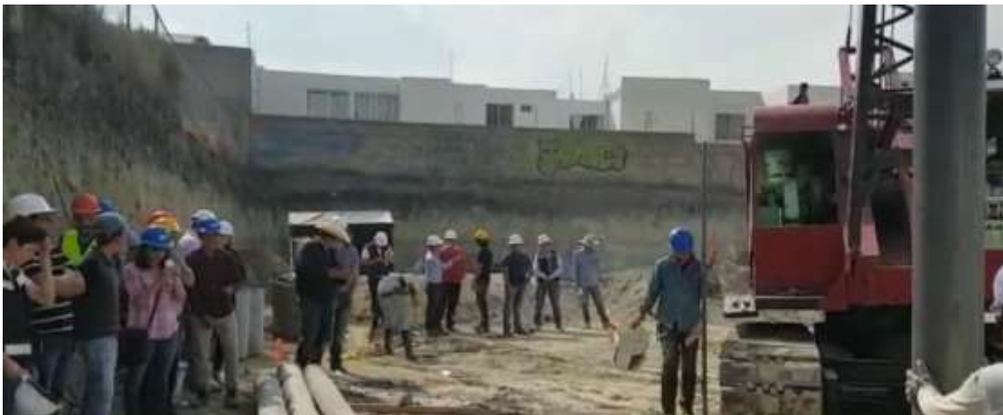
Figure 2. Drilling and casting pile foundations.