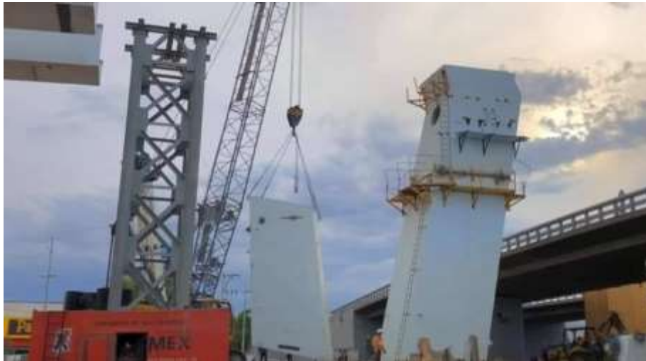
Figure 4. Cable-stayed bridge pylon assembling.