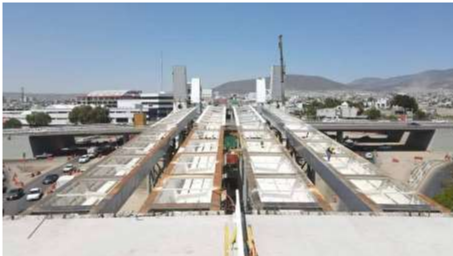
Figure 6. Box girders.