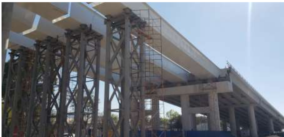
Figure 7. Box girder supported before the prestressed tendons are placed.