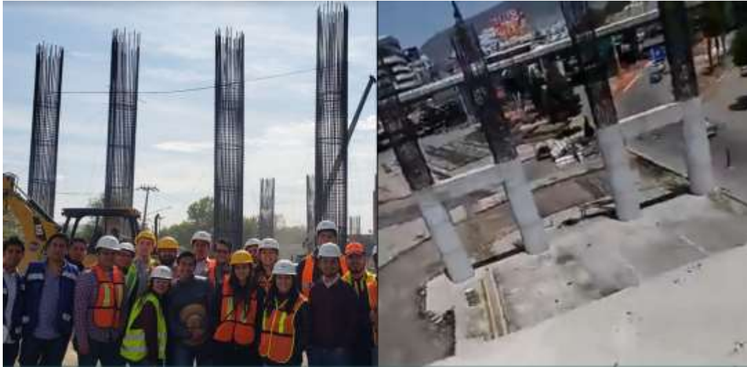
Figure 1. Cable-stayed bridge visit (foundation and column casting).

One of the most interesting and complete site visit was to a cable-stayed bridge in Pachuca, Hgo. We had the opportunity to make three visits there in different stages of the construction.