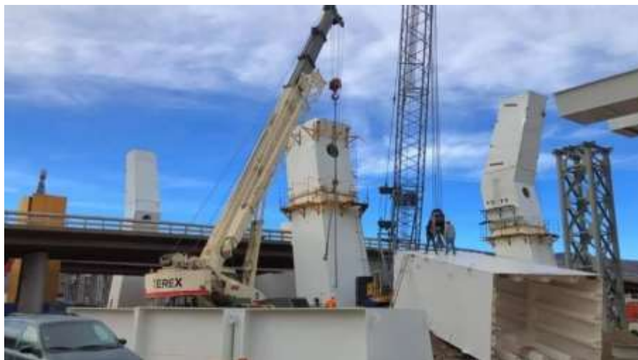
Figure 8. Interior reinforcement of the pylons to prevent buckling.

When we studied structural steel elements in compression, the general buckling and local buckling concepts are not clear enough in their real-life application, watching the interior of the pylons prior to their installation the students realize exactly how this phenomena is prevented and how useful is to know the basis of buckling to calculate their restrictions.