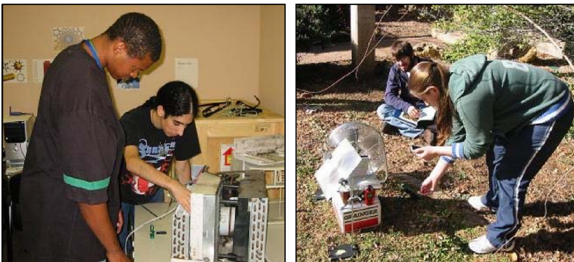
Figure 3: Team-based, hands-on learning was a key aspect of the Researcher Incubator experience as were opportunities to lead teams and receive mentoring from more experienced research students. To learn how thermal-fluid engineering systems work, students conducted a mechanical dissection of an air conditioning unit (left). Students also designed and carried out their own experiments, such as a solar concentrating energy generation study (right).

selected for Researcher Incubator membership contributed to success. In conventional engineering undergraduate research opportunities, students rarely have ownership of their projects, and they often work on menial tasks under the close supervision of a graduate student or other senior researcher. Relegation to the margins can instill a sense that students are not responsible for the outcomes they produce and that a senior researcher looking over their shoulder will correct any careless mistakes. By design, the Incubator gave undergraduates complete ownership and mastery of their projects with almost no oversight (Figure 3), which for many students was a welcome responsibility and challenge that had never before been bestowed in an educational environment. Students (especially Team Leaders) adopted a vigorous level of focus and commitment to these projects, often spending long hours in the labs and writing many drafts of research manuscripts. Once given the responsibility to own a research project, undergraduates began behaving like graduate students in these respects.