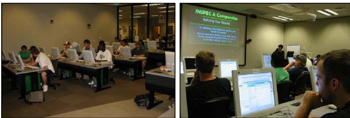
Figure 1: Lower-division student researchers learn how to perform literature searches (left) in a library information session given by a UNT engineering librarian (right). Acquisition of literature search skills is essential for students to locate needed technical information under the just-in-time learning paradigm.

For example, a seminar was given by the UNT engineering librarian on how to use technical search utilities, including Scirus, INSPEC, Compendex®, Google Scholar, and Engineering Village to locate technical references. Students then completed a homework assignment to perform a literature search and write a review for their research topic. To connect this assignment to research activities, students’ literature reviews were later assimilated by their research team into outgoing technical papers and presentations. Lower-division students also worked in groups with their team leaders to: