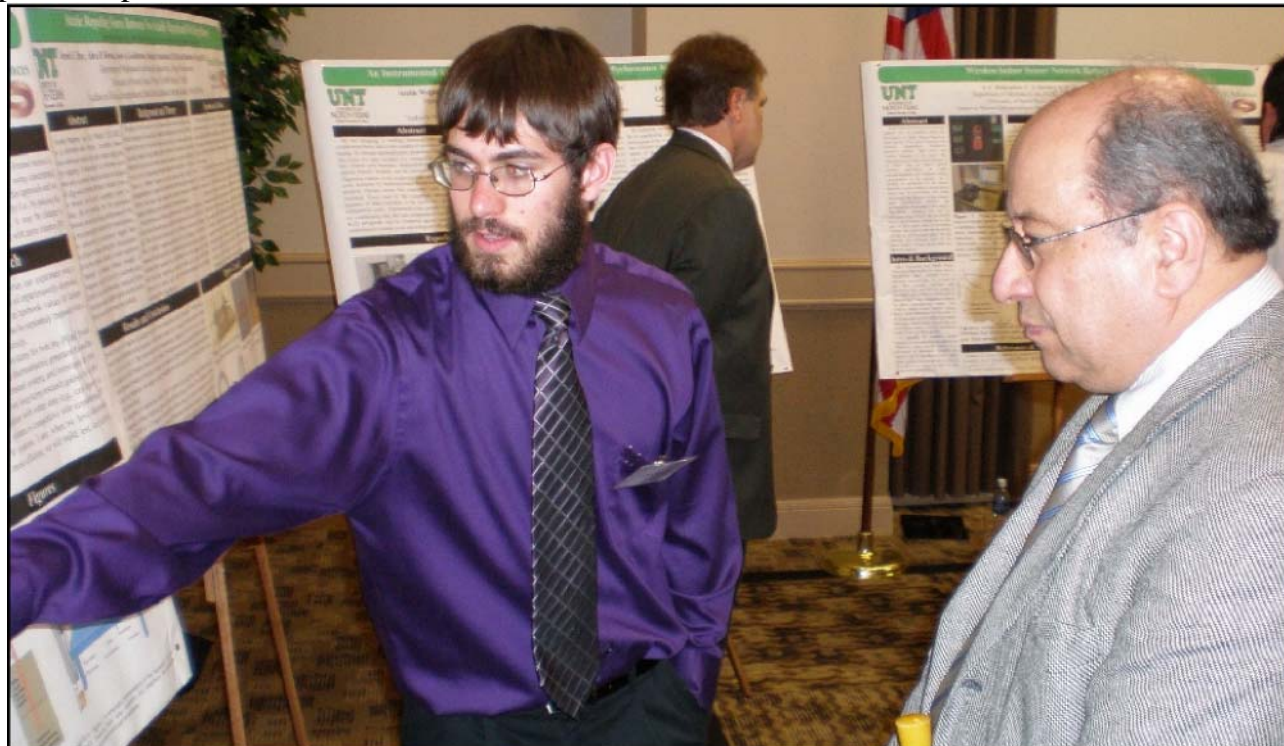
Figure 4: While delivering poster and plenum presentations, undergraduate researchers interacted with senior members of the technical community, to build valuable experience in technical discourse.

on the faculty advisor's laboratory Web site, and each new student presentation was immediately posted on the lab's publication list. For many students these public postings represented the first time they could Google themselves and get hits associated with efforts beyond social networking sites. This public success and recognition was then easily shared with peers, friends, and family, and provided positive reinforcement to motivate more work.