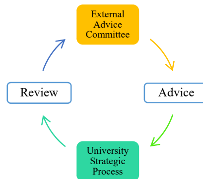
Figure 2. Review/Advice circle involving the External Advice Committee.