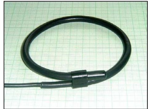
Figure 2: Flexible Rogowski Coil http://www.rocoil.co.uk

in the frequency domain. In the past, this would cost extra money and be somewhat unreliable due to the use of analog op-amp integrators, which tend to degrade in accuracy over time<sup>6</sup>. The release of the Analog Devices ADE7753 Power Measurement Chip<sup>7</sup> has now introduced the first "meter in a chip" solution to include a digital integrator and the ability to measure reactive energy. This is a key factor in cost reduction and simultaneously allows the design to be more compact and reliable. The Rogowski Coil in conjunction with the ADE7753 presents the opportunity to manufacture a more costeffective power-monitoring device for sub metering applications than what is currently available. As