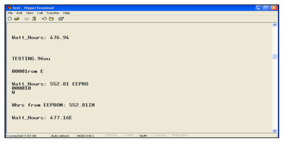
Figure 3: Screen capture of program acquiring watt-hour readings

Communication between the metering circuit and the user is accomplished through a Maxim RS232 transceiver. The prototype will connect to the serial port of a PC. The Windows HyperTerminal program on a PC is the medium presently used to read incoming data. Figure 3 is a live screenshot from the initial "proof of concept" prototype. It is functioning as a Watt-hour meter. Field test prototypes however, will have the ability to connect to the serial port of a PDA for ease of data collection. Future additions to the communication aspect of the device may include USB or wireless data transfer to accelerate the data recovery process. These would be minor adjustments based off existing proven wireless data transfer technology (i.e. 802.11b/g or Bluetooth). Hardwiring the data output is being avoided to maintain the portability of the system.