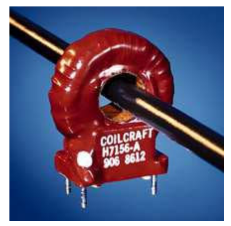
Figure 1: Rigid Rogowski Coil http://www.coilcraft.com

forces the user to disconnect the conductor (forcing a power outage at the site) and feed it through the center of the coil. This more labor-intensive application may require, in many jurisdictions, a licensed electrician and an electrical permit. In contrast, the flexible coil can be opened and wrapped around a conductor, then rejoined. This requires no interruptions in electrical service, no licensed electricians (as no circuits are opened or rewired) and no electrical permitting. This also allows the electronic metering device to be used in awkward locations that may have been previously impossible to measure. Additionally, energy auditors who are constantly monitoring power in different locations may especially find this to be an extremely powerful tool as it can readily be moved across a campus to monitor various buildings for several days at a time and