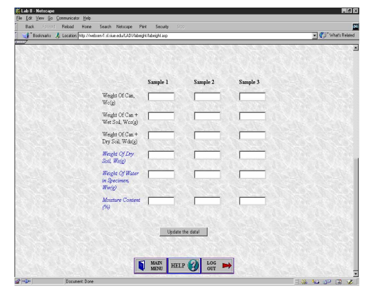
Figure 6B. "Lab #8" Screen 2