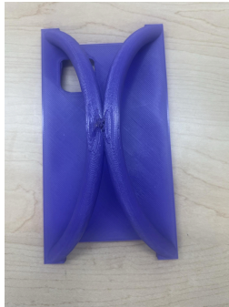
Figure 2 Ram Horn Phone Case

Ram horn phone case where the students modified the infill and shape to replicate ram horns.